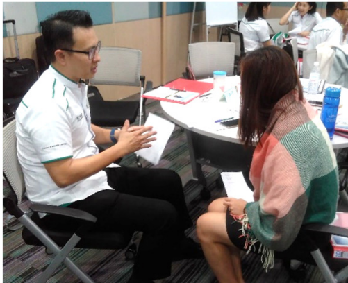
Participants practicing the AIDE feedback